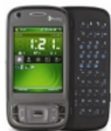
Windows Pocket PC®